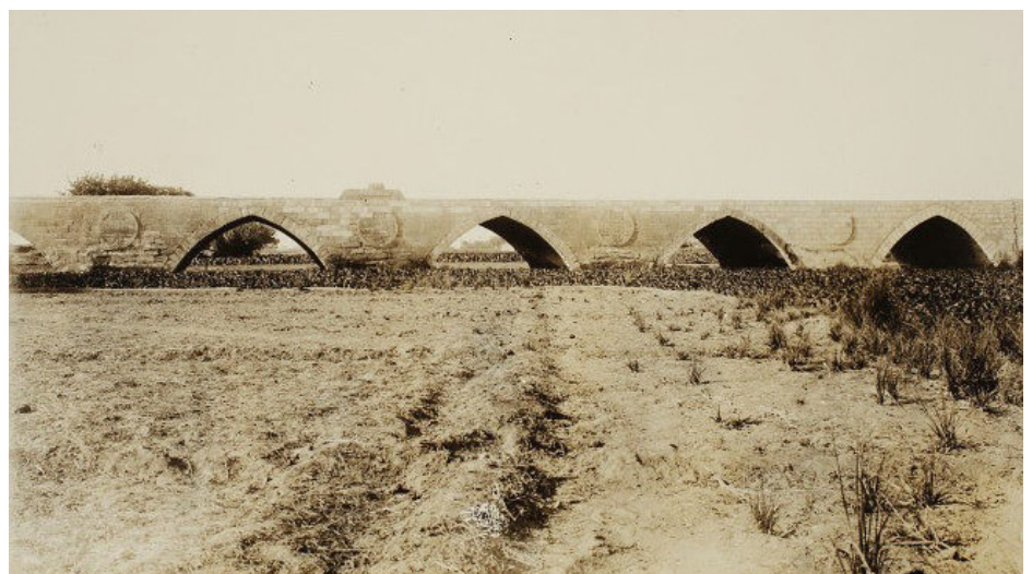
Figure 1: Bridge over the former Abū l-Munajja Canal which regulated the irrigation of the eastern Nile Delta, Cairo, 1260s.