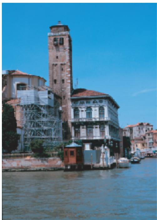
D. Camuffo, 2002